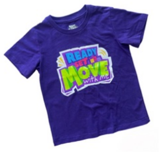
T SHIRT $25

All READY SET MOVE students will be required to wear the official uniform that we are sure you will love. Below are the following options that can be purchased at reception.