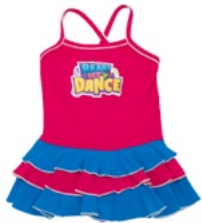
TUTU FRILL DRESS $45

All READY SET DANCE, READY SET BALLET & READY SET ACRO students will be required to wear the official uniform that we are sure you will love. Below are the following options that can be purchased at reception.