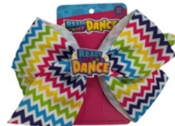
HAIR ACCESSORIES $10