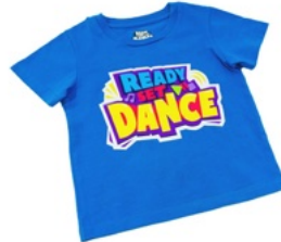
T SHIRT $25