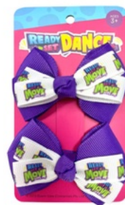
HAIR BOWS $10 HEAD BAND