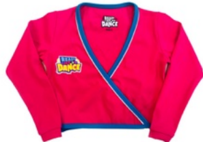
CROSS OVER $45