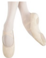
BALLET, TAP & JAZZ SHOES $45-$70